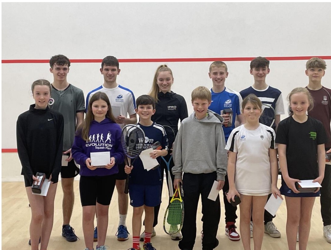
All (well actually most) Winners and Runners-Up

The images shown below are of the Winners and Runners-Up in the various age group competitions.